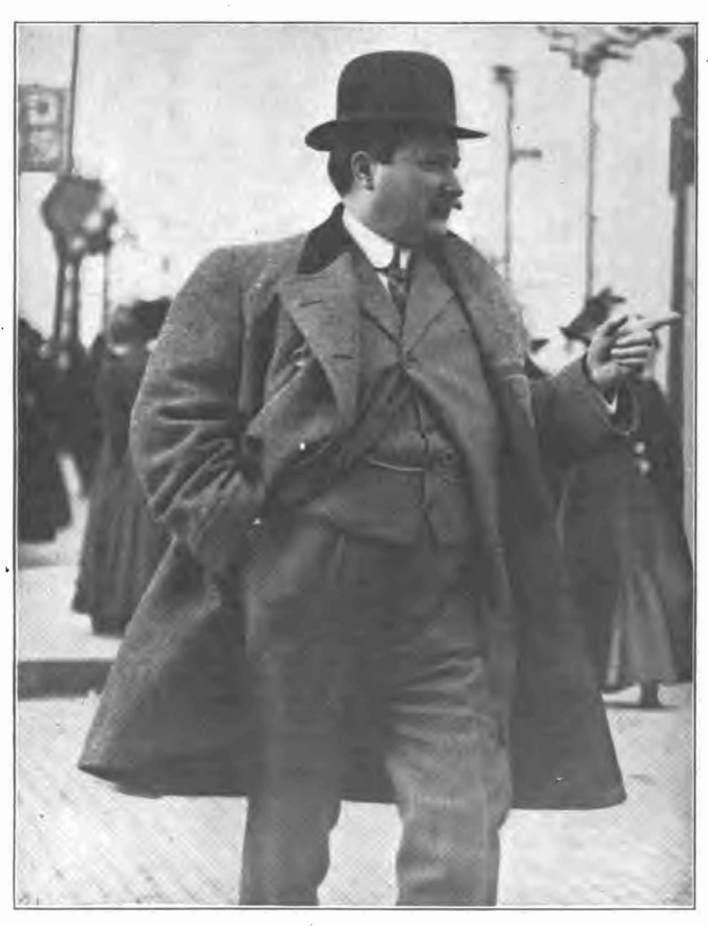
WILLIAM J. BURNS

DURING THE LAST SIX MONTHS HE HAS BEEN CONSTANTLY BEFORE THE PUBLIC IN A SERIES OF SENSATIONAL CASES, SUCH AS THE BRIBERY INVESTIGATION IN THE OHIO LEGISLATURE AND THE ARREST OF THE LOS ANGELES DYNAMITERS