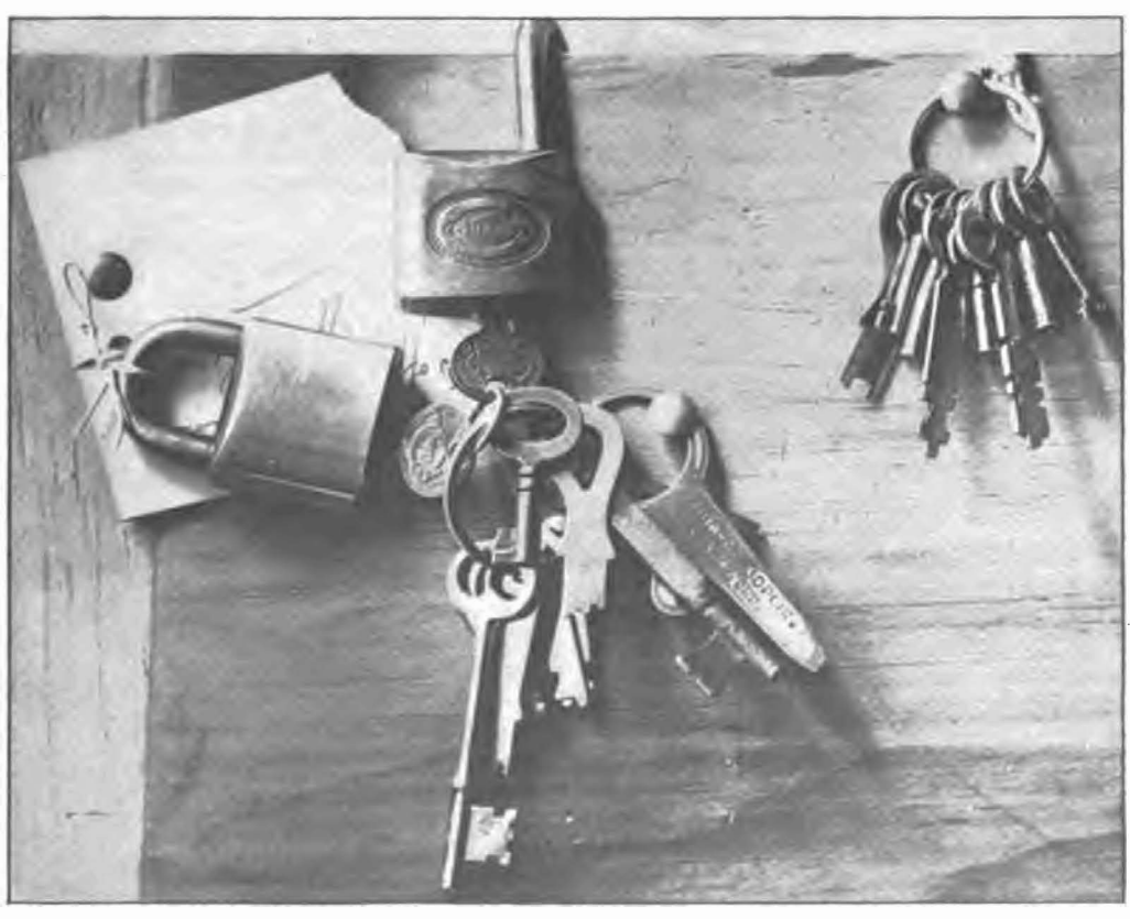
THE KEYS THAT WERE FOUND ON THE DYNAMITERS, AND SOME OF THE LOCKS TAKEN FROM THE BOXES IN WHICH DYNAMITE WAS STORED Digitized by

but there were others in authority who did not "The end of it was that I had to go ahead and trust me any more than they trusted other prifinance the investigation myself. It cost me