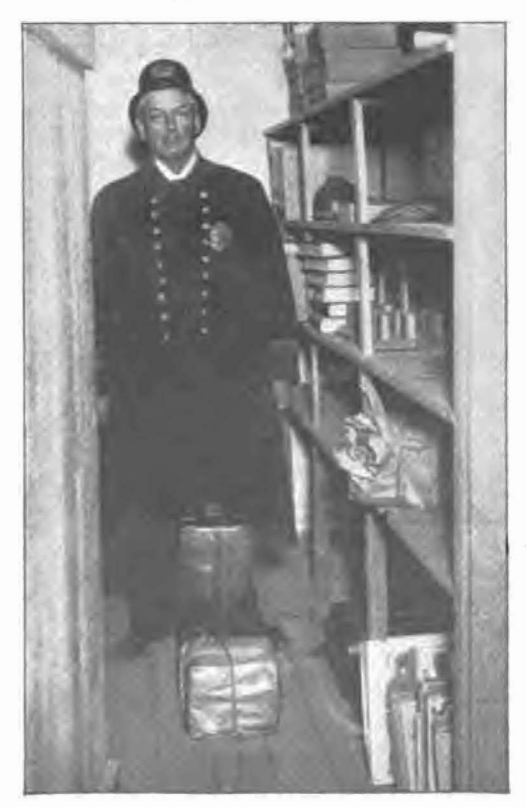
DYNAMITE FOUND IN THE VAULT OF THE IRON-WORKERS' UNION AT THEIR HEADQUARTERS IN THE AMERICAN CENTRAL LIFE BUILDING, INDIANAPOLIS

"In 1908 the dynamitings amounted to a 'reign of terror.' We were given a record for that year of twenty big explosions on different works, besides four attempted explosions and three cases of tampering with machinery. There were explosions in Cleveland, where some girders were blown up: in Elsdon, Illinois, where a building was wrecked; in Clinton, lowa, on a railroad bridge; on a Pittsburg Construction job at Chicago; on a bridge across the Raritan River at Perth Amboy, New Jersey; on a B. & O. bridge near Bradshaw, Maryland; on the Chelsea Piers in the city of New York; in bridge materials for the American Bridge Company in the Pennsylvania Railroad yards at Philadelphia; on a bridge over the Miami River at Dayton, Ohio; on railroad bridges or viaducts at Bay Chester (New York), Aikin (Maryland), Somerset (Massachusetts), Buffalo, Cincinnati, St. Louis, and in buildings at Cleveland and Kansas City — and so on. On the night of